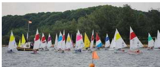
Access 2.3 Start Line

Two practice races were held on Sunday with 9 races planned for the rest of the week.